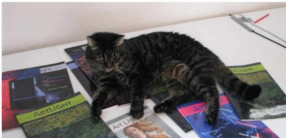
Our office cat will help you a little. Meow!

≡ publish my work ≡ promote my project ≡ share my vision ≡